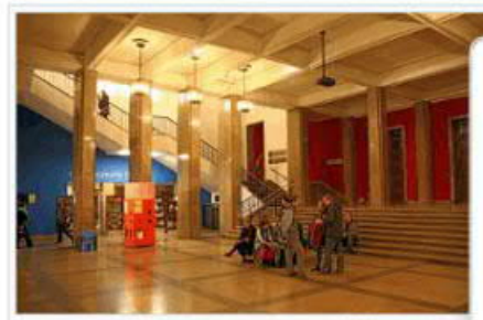
The National Museum in Kraków is one of Poland's finest galleries of art.

Other notable museums in Krakóv Konopnickiej 26),<sup>[204]</sup> Stanisław V in Krzesławice,<sup>[56]</sup> – a museum de Museum,<sup>[205]</sup> and Józef Mehoffer